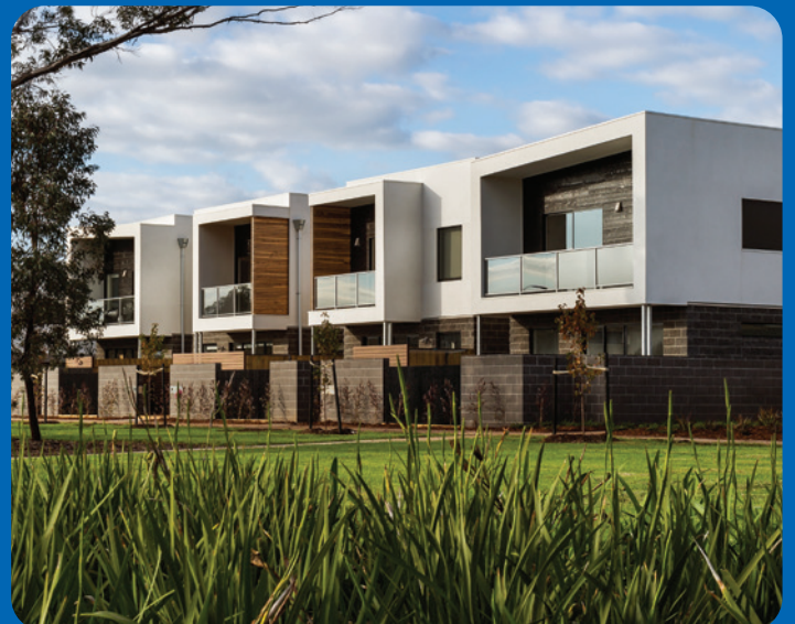
Multi-Residential - Sunshine, VIC