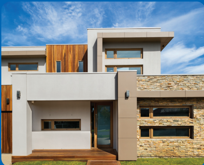
Residential - Essendon, VIC